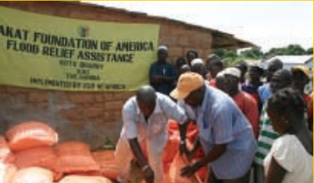
> Gambia has experienced the worst flooding in years.

The borders of this small African nation follow the meandering Gambia River and its tributaries. Many farms have been destroyed and livestock carried away by floodwaters in the most affected areas inland. The floodwaters have also contaminated clean water supplies, increasing the need for development projects. Zakat Foundation will continue its work in Gambia during the 2009 Udhiya Season and will assess further sustainable development projects to help the people of Gambia to lift themselves out of the hardships caused by the recent floods.