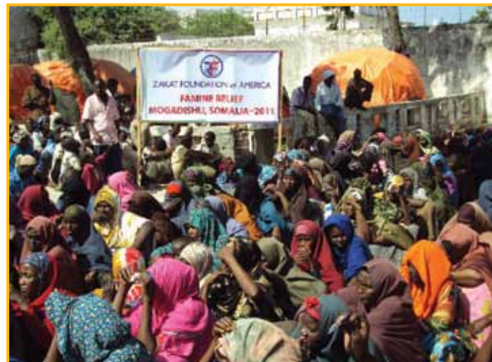
Famine survivors receiving food aid from ZF