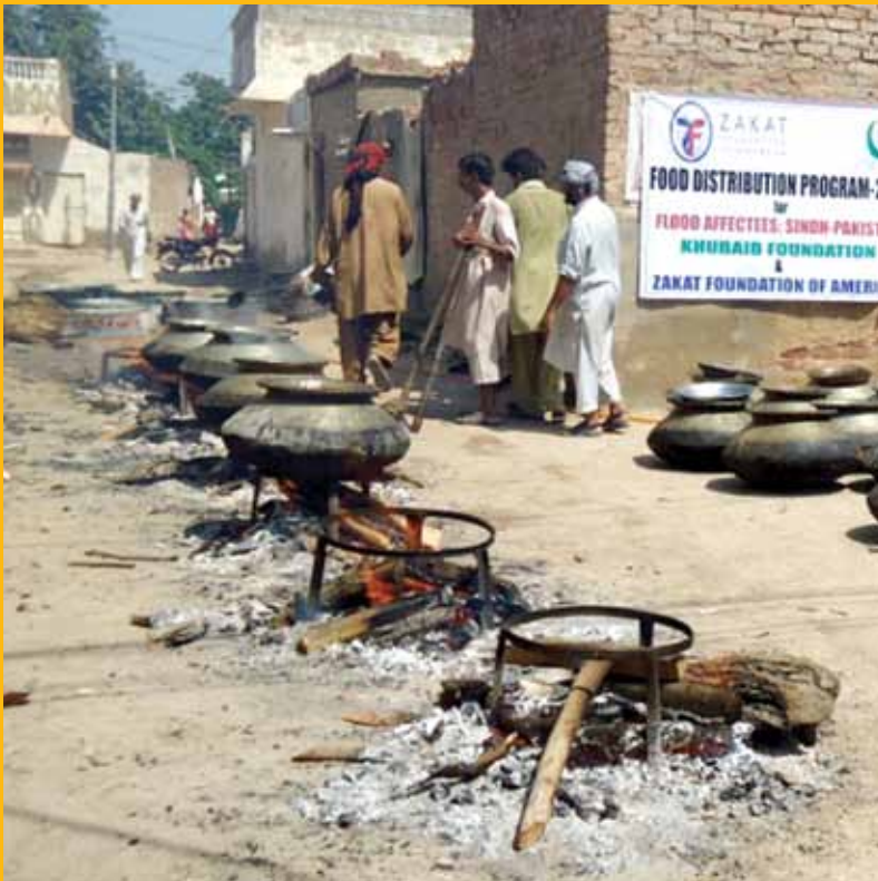
ZF Representatives cooking warm meals for flood survivors

Presently, we are working with our local partners and have pledged $50,000 for emergency relief in areas affected by the floods. With this strong partnership and our experience in the region we have the potential to reach many lives in desperate need. Time is of the essence. Please do not wait to reach out to those who are wondering if and when help may come. Donate today. ■