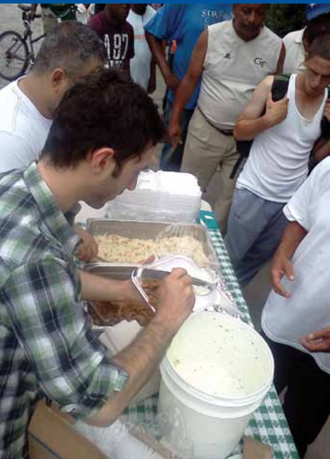
Top to bottom: Backpack beneficiaries in Delaware; ZF volunteers distributing food in Atlanta