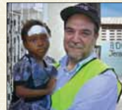
Khalil in Haiti assisting with relief

p.s. Please use the enclosed donation worksheet to rush your tax-deductible donation or donate online at ZAKAT.ORG .