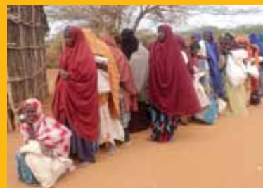
Famine survivors receiving food aid from ZF