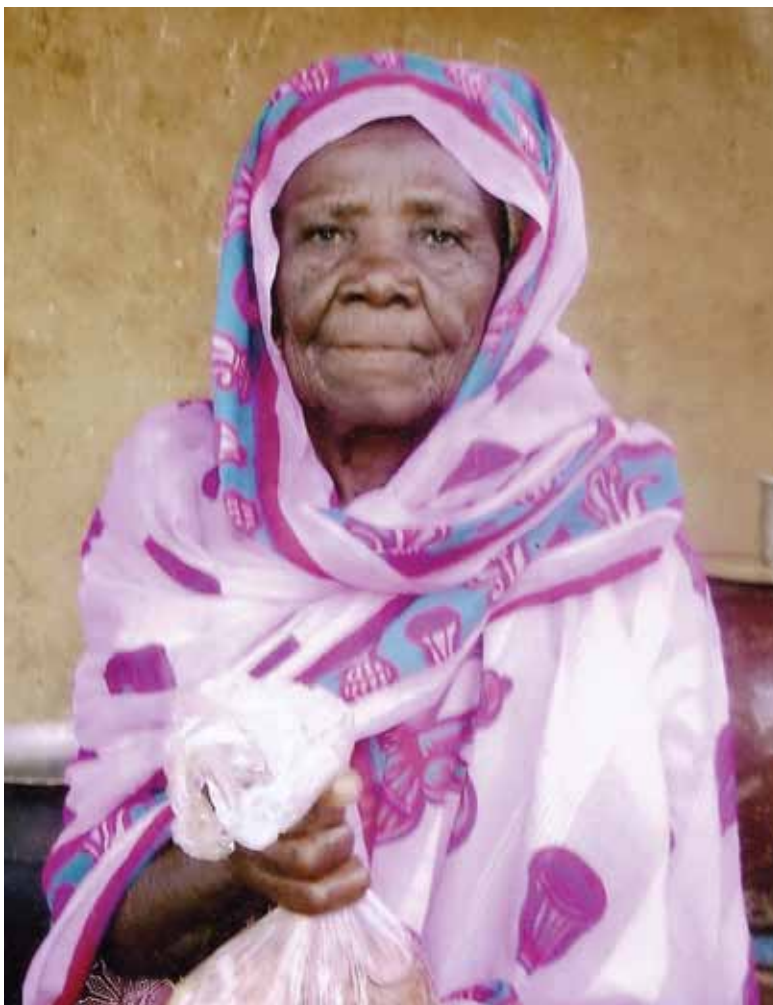
ZF Udhiya/Qurbani 2010 beneficiary with fresh meat

Natural disasters such as flooding, earthquakes, droughts, or man-made disasters such as wars affect the prices of animals. In Pakistan, the price of Udhiya/Qurbani skyrocketed because there was a shortage of supply due to the high number of livestock that perished in the flood. Another reason for the differences in prices is that some countries supply fewer animals than the demand, or the demand suddenly increases before Eid. So if you see a price difference do not be surprised, rather pray for all those who have been affected by the flood water and give generously to support those in need. ■