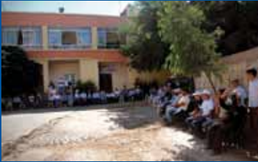
Clinic in Lebanon to aid Syrian refugees