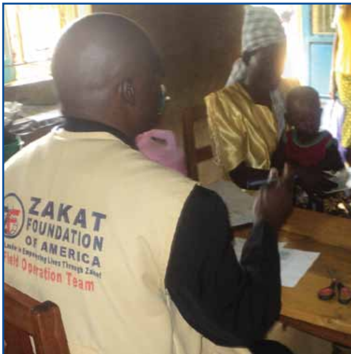
Kenyan mobile clinic beneficiaries receiving medical screenings

ZF is committed to providing the marginalized with adequate health care and health education in order to eradicate treatable illnesses and diseases in Kenya. ■