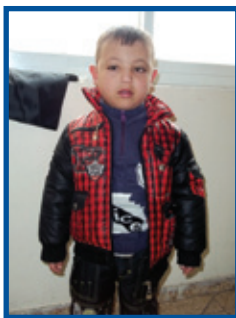
Kidney surgery beneficiary.