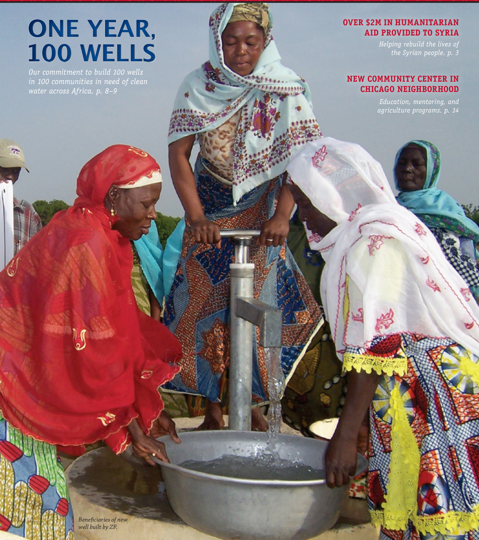
Beneficiaries of new well built by ZF.

Education, mentoring, and agriculture programs. p. 14