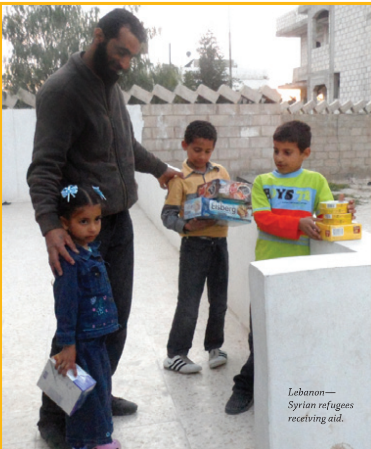
Lebanon— Syrian refugees receiving aid.

Here in the US, ZF is sponsoring regular fundraisers and donation drives in cities across the country to raise money for the people of Syria during this time of need. ZF remains committed to providing emergency relief to the people of Syria to help rebuild the lives and communities of the Syrian people. ■