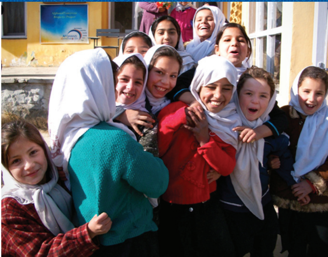
Students at the Afghans4Tomorrow elementary school