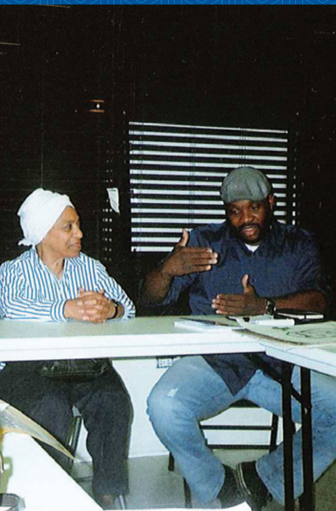
USA—ZF community center in Chicago's South Shore neighborhood.