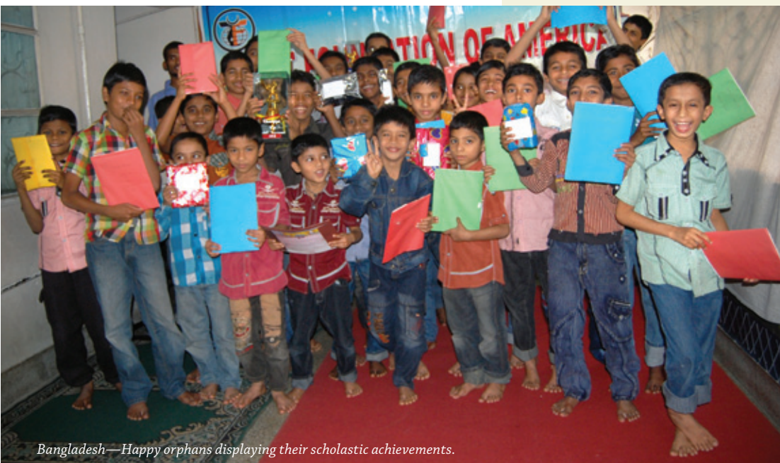
Bangladesh—Happy orphans displaying their scholastic achievements.

Kenya—Top Two: Completed mosque. Bottom: Women praying for ZF for building a new mosque.