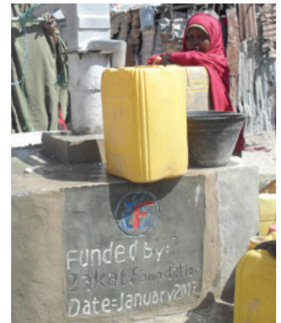
Somalia—Beneficiaries happily getting fresh, clean water from a well built by ZF.

The situation in war-torn Somalia is getting worse each day and its people—especially its children—are dying in appalling numbers due to lack of food and water.