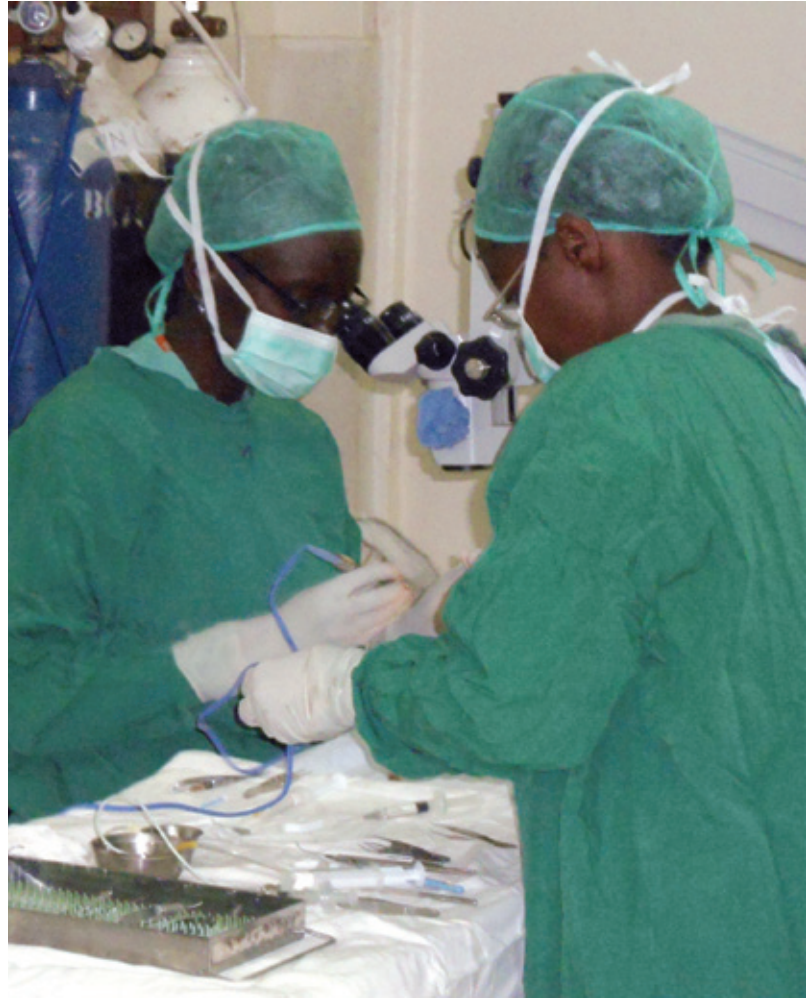
Doctors performing cataract surgery on one beneficiary.

The patients of the mobile health clinics express their gratitude daily to ZF volunteers who work in the clinics, but the real thanks goes to our donors who help us keep projects like this one alive. ■