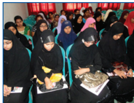
Sri Lanka—COMTECH scholarship awards ceremony.