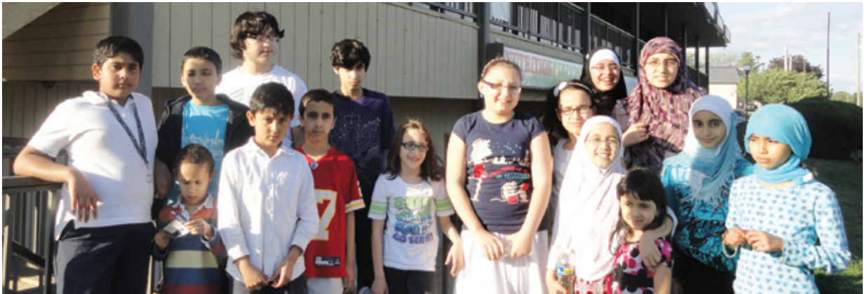
USA —Delaware youth fundraising team.

We welcome you to join these enterprising kids and be part of our One Year 100 Wells Campaign and help provide the most basic human need, water, to the people of Somalia. ■