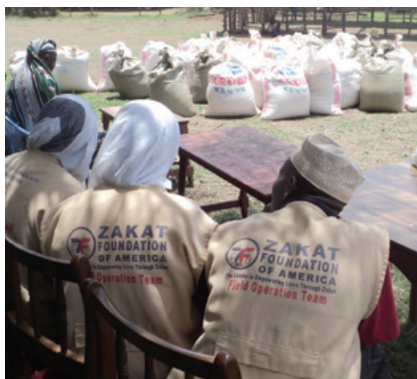
Kenya—Beneficiaries receiving food packages.

Right now, families affected by the flood have enough high energy and protein foods to sustain them for the next three months. Hunger and starvation has become a problem of the past and the people of Kenya and Uganda are looking toward the future. ■